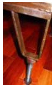
Barn Door Table