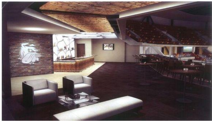
On the Ceiling in a Convention Center