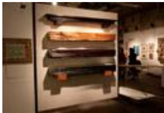
Mantels made from one etched pine beam