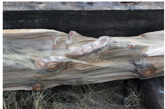
Grain Etched Beams

These are “ Grain Etched ” eastern white pine walls and Beams that have been salvaged from an Old Grain Elevator, circa 1887.