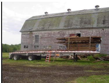
The First Storage Barn