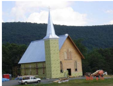
Reconstruction Progress to date....

There are more churches for adoption on our Catalog page in the Churches Category