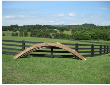
The New Site