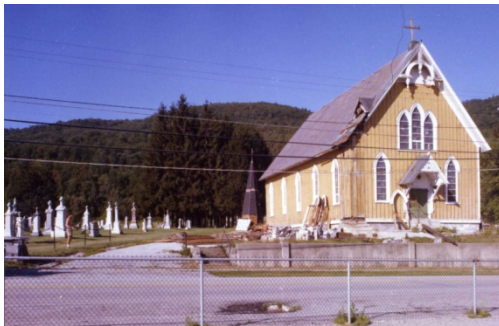
The Church in its Original Location

It had been in storage for 28 years waiting for a Steward to come along and reconstruct it. It was under the care of one of the many timberframers who do not maintain a computer presence. Through Architectural Global Network and many of its Network Colleagues, not only did a Steward come along, a wonderful steward came along. The new location is probably very akin to what the original location was when the building first came into being. This project is a living result of the collaboration of a team of Deconstructionists and a team of Reconstructionists and the strength of the Network partners working together. After 28 years, the building is safe.