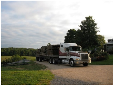
Transporting to the New Site