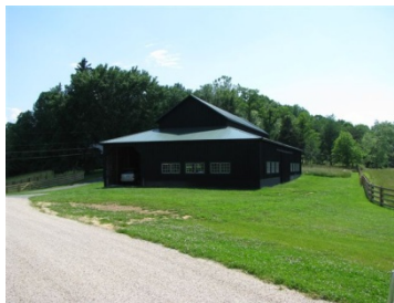
The Second Storage Barn