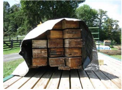
Off-loading & Organizing by Priorities