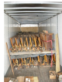
Loading for Home